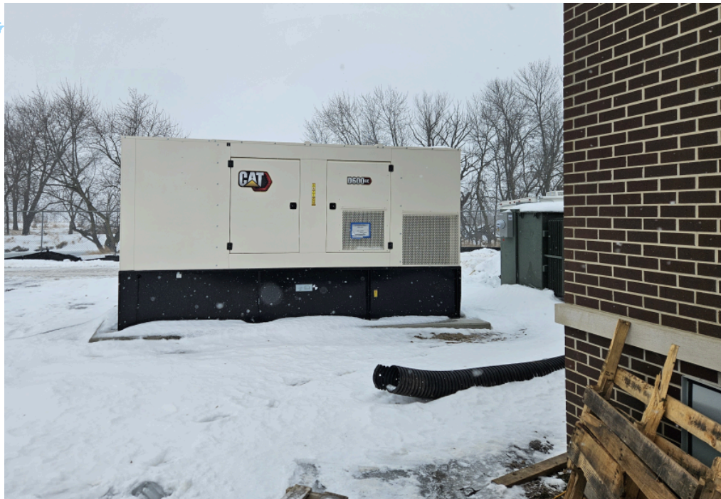
New Standby Generator 12/10/2025